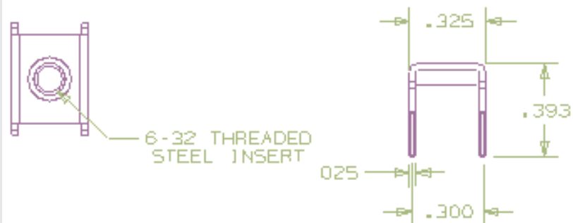
RECOMMENDED PC HOLE SIZE .040±.003.

ITW Pancon An Illinois Tool Works Company 309 E. Crossroads Parkway Bolingbrook IL 60440 Phone 1 888 515 2100 Fax 630 972 8900 www.itwpancon.com